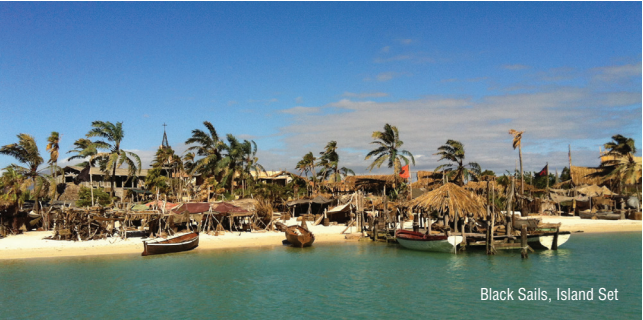
Black Sails, Island Set

are hosted in Cape Town promoting the local industry. Some of these festivals include the Encounters Documentary Festival, Cape Town International Animation Film Festival, Wavescape Festival and Cape Town International Film Market & Festival .