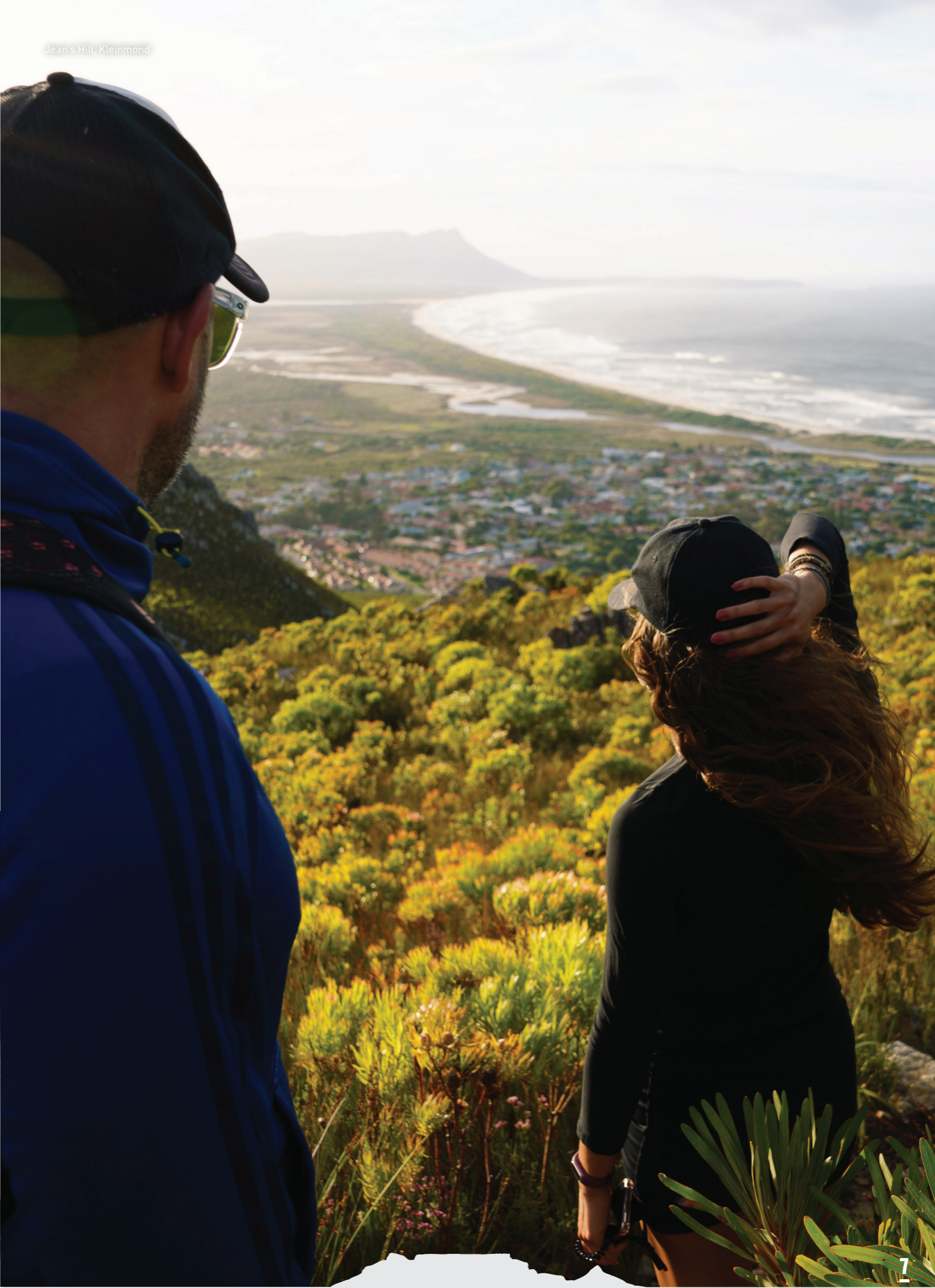
Jean’s Hill, Kleinmond

Glide on the longest over-ocean zipline in the world