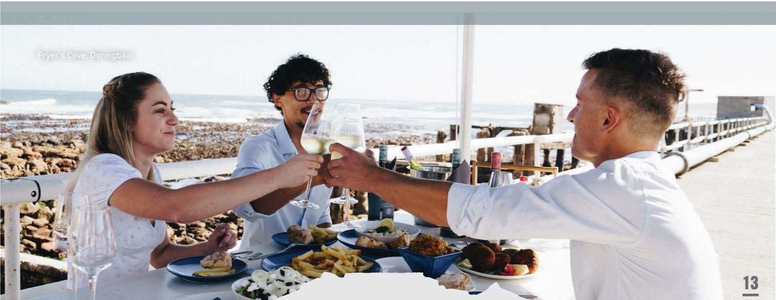
Fryer's Cove, Doringbaai